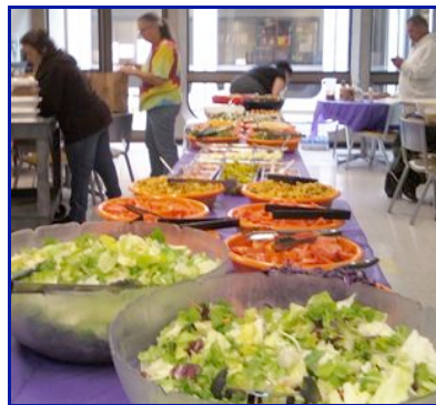
Transportation Department Salad Bar Luncheon raised $615.00